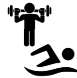
Fitness Center & Pool

This is where your tenants will dispose of junk mail mostly and the occasional bottle or can from their car.