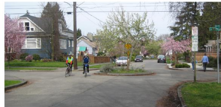
Neighborhood traffic circle