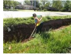
Public Works in Action: Clearing a drainage ditch