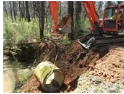
Public Works in Action: A piece of Kubota equipment removing old infrastructure