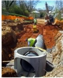
Public Works in Action: Replacing a stormwater pipe

In honor of Public Works Week, Athens-Clarke County Unified Government is sponsoring a Rolling Truck Tour where public works trucks and equipment will travel to local schools, including Alps Road Elementary, Barnett Shoals Elementary, J.J. Harris Elementary, Chase Street Elementary, Cleveland Road Elementary, Oglethorpe Avenue Elementary, Fowler Drive Elementary, St. Joseph Catholic School, and Kaleidoscope Montessori School. Students will get to see, hear, and touch the trucks, as well as learn about the hardworking individuals who operate them.