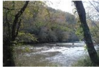
The North Oconee River