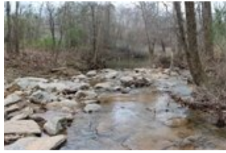
Hunnicutt Creek converging with the Middle Oconee River