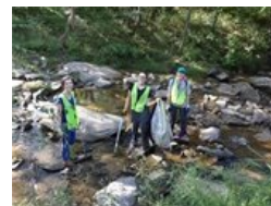
A group cleaning up Pulaski Creek.