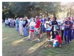
Volunteers waiting to be briefed on safety.