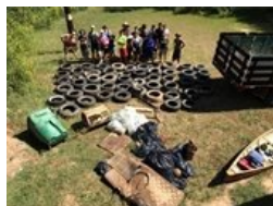
Volunteers from the Middle Oconee Float site.

[ https://photos.google.com/share/AF1QipMQ7UIw7Y_paHB1fFSI6PVYITaaORhJl4iwpUZnupoH-uxSmp3GsHWnohnX7tzdhA?key=OW9ObxNHTTVwOEJocoFhTkNCZDFuQzliUTVDUoh3 ]