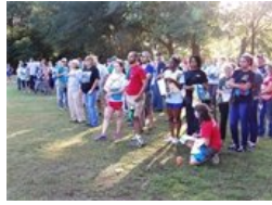
2016 volunteers gather at the kick-off event.