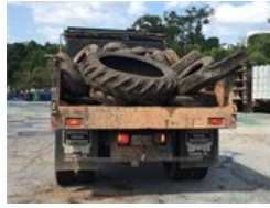
A truckload of tires that were pulled out of the North Oconee River in 2016.