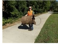
You never know what kind of trash you'll find!