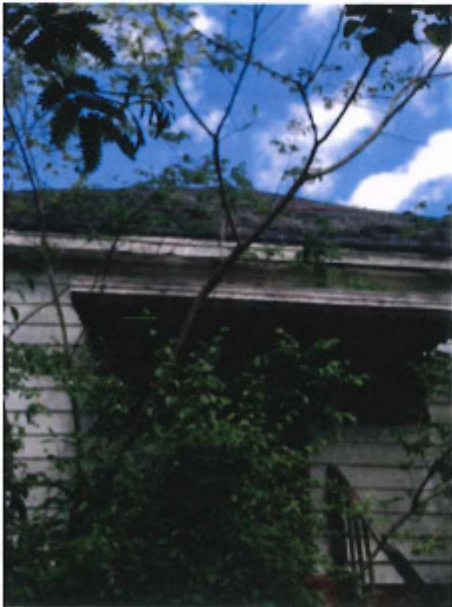
Left Side of House