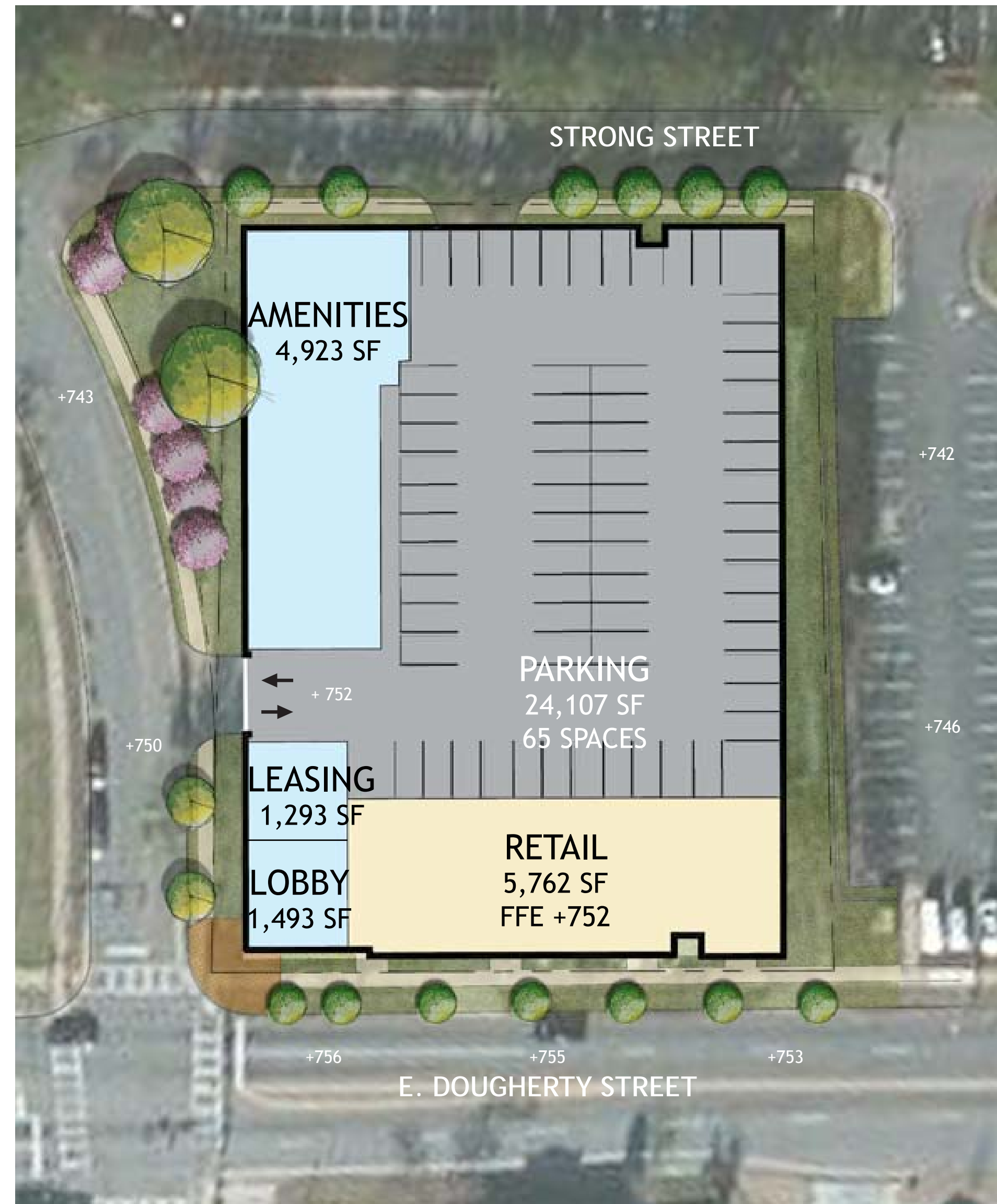
GROUND LEVEL +752 DEVELOPMENT SUMMARY RETAIL: 5,762 SF LEASING: 1,293 SF LOBBY: 1,493 SF AMENITIES: 4,923 SF 65 PARKING SPACES