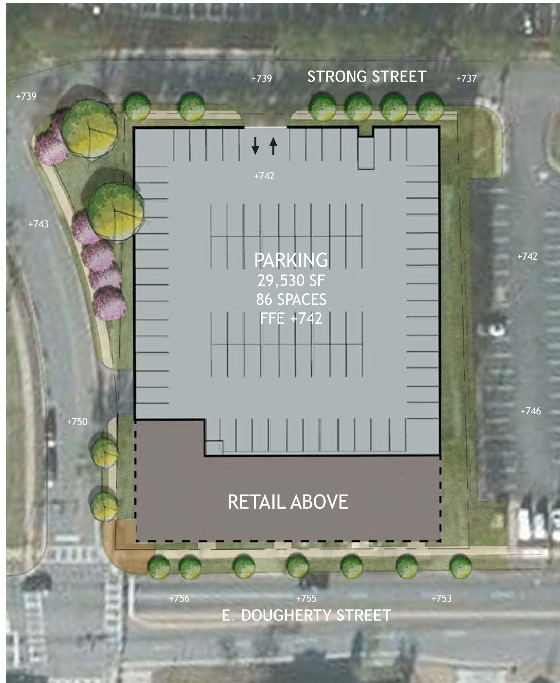
BASEMENT LEVEL +742 DEVELOPMENT SUMMARY 86 PARKING SPACES